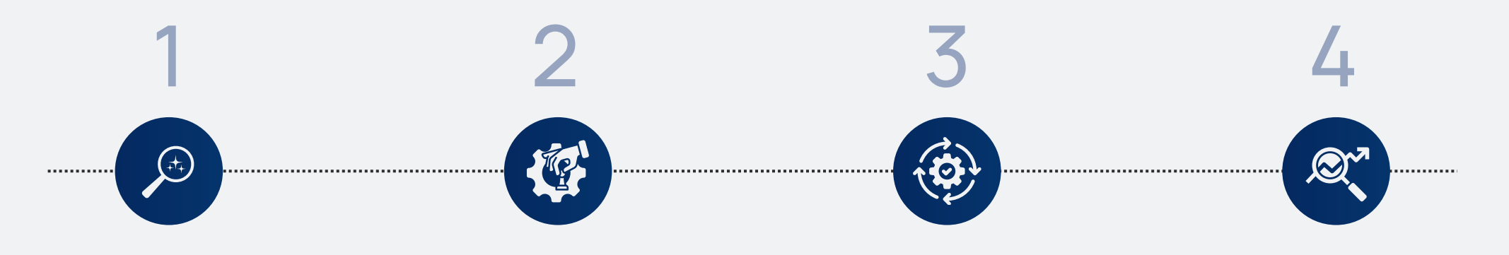
Discovery and Analysis

We follow a streamlined and agile project handling process while having transparent workflows & realistic timelines: